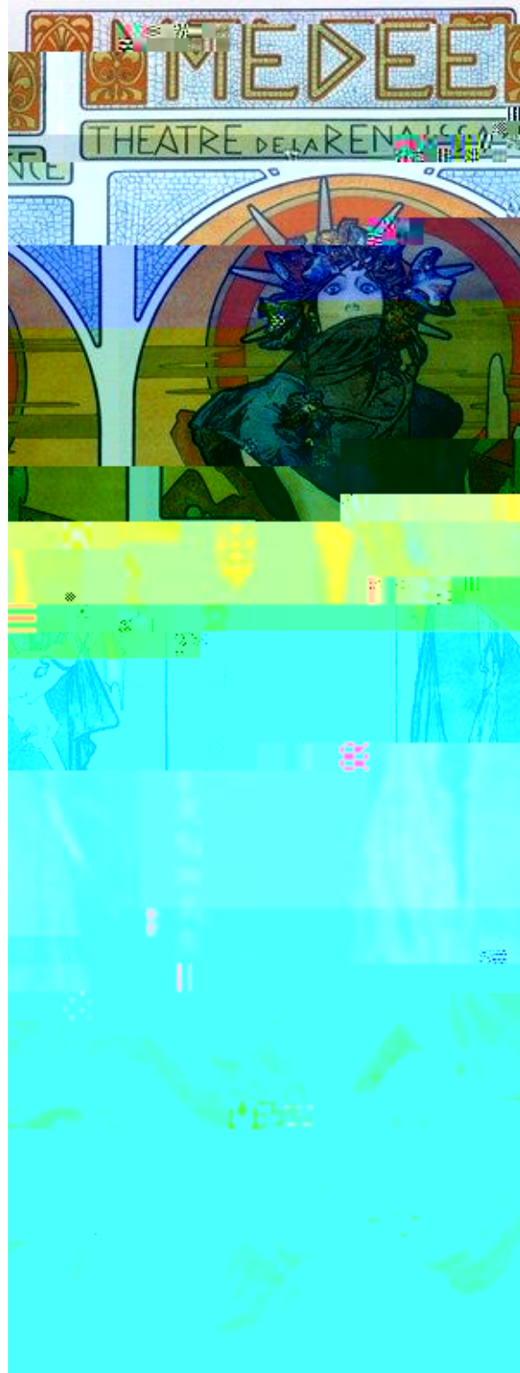
Figure 3: Alphonse Mucha, Médée , 1898, 2011.55, lithograph on paper, Bowdoin College Museum of Art, Brunswick, Maine.